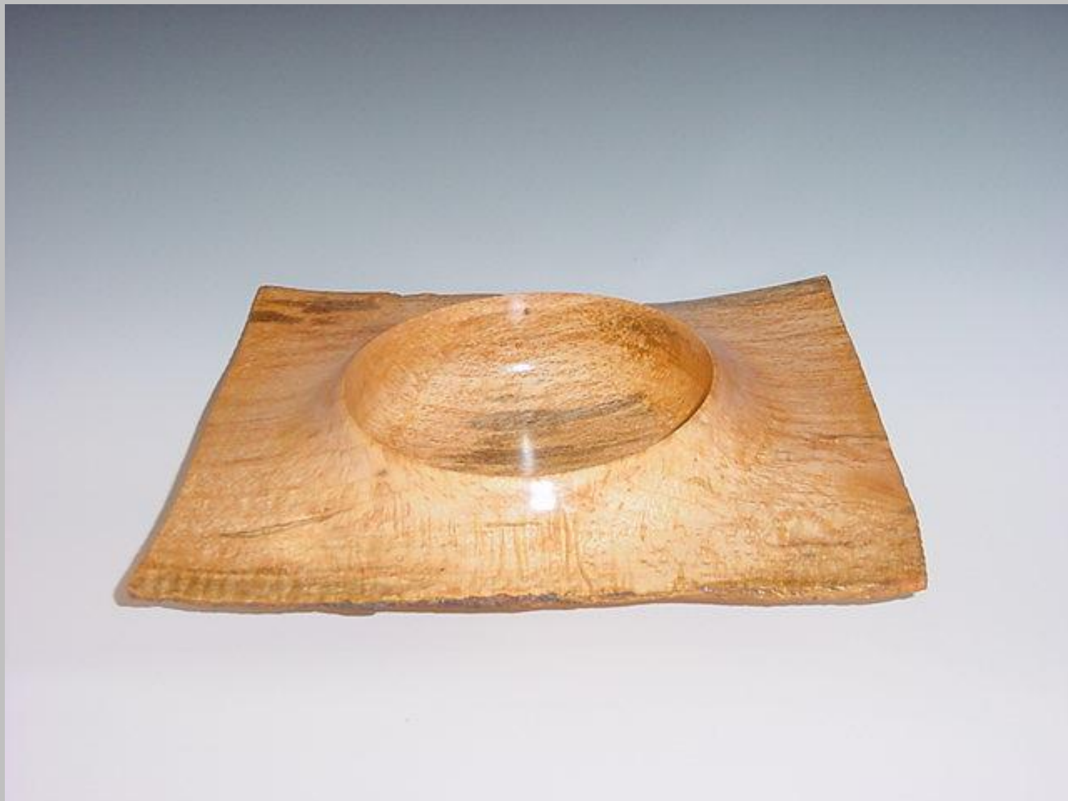
Clifford Faulkner, "Natural Edge Bowl", Soft Maple, Quilted, Birdseye Burl