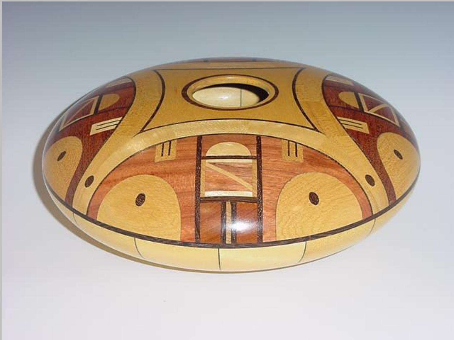
Romeo Corriveau, "Segmented Hollow Vessel"