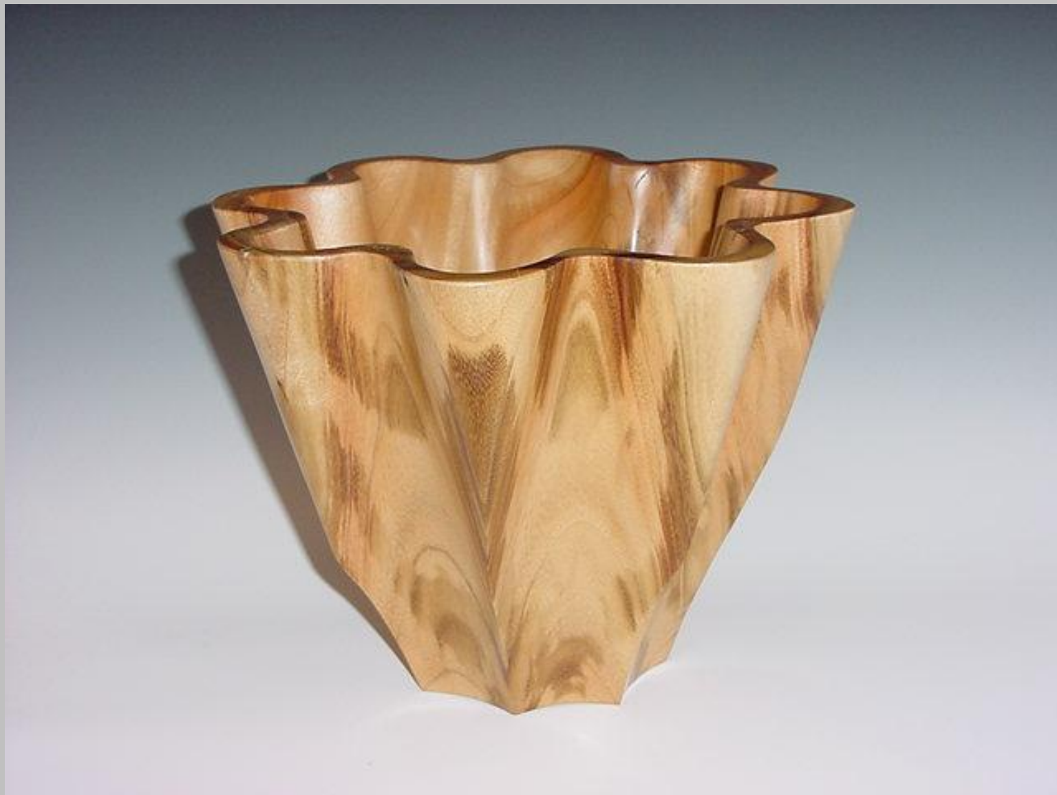
Al Caton, "Vase", Camphor