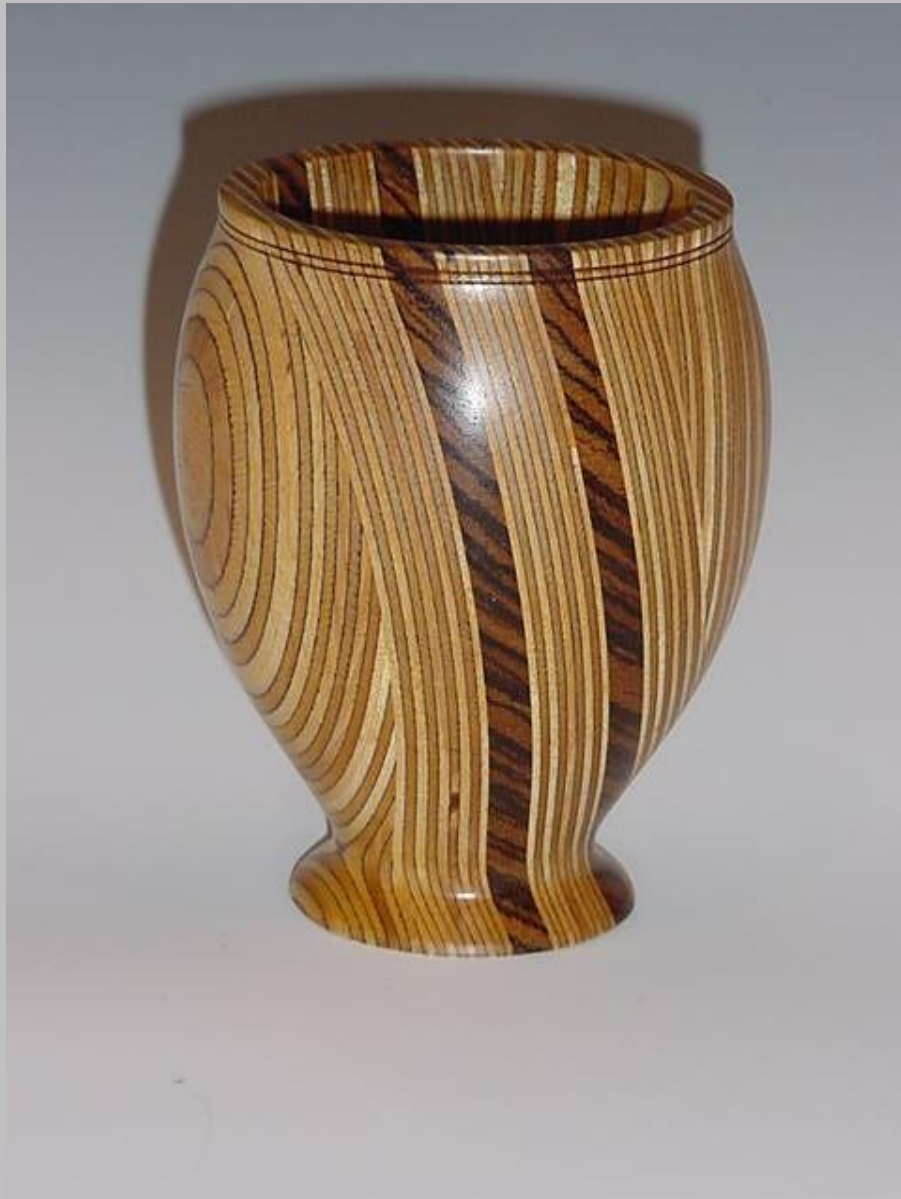
Clifford Faulkner, "Small Vase", Finnish Birch plywood and zebrawood