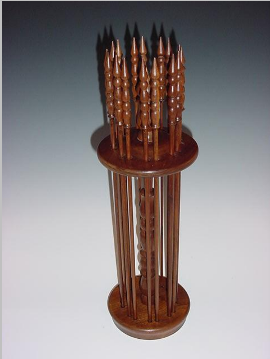
Cliff Sessions, "Knitting Needles", Black Walnut