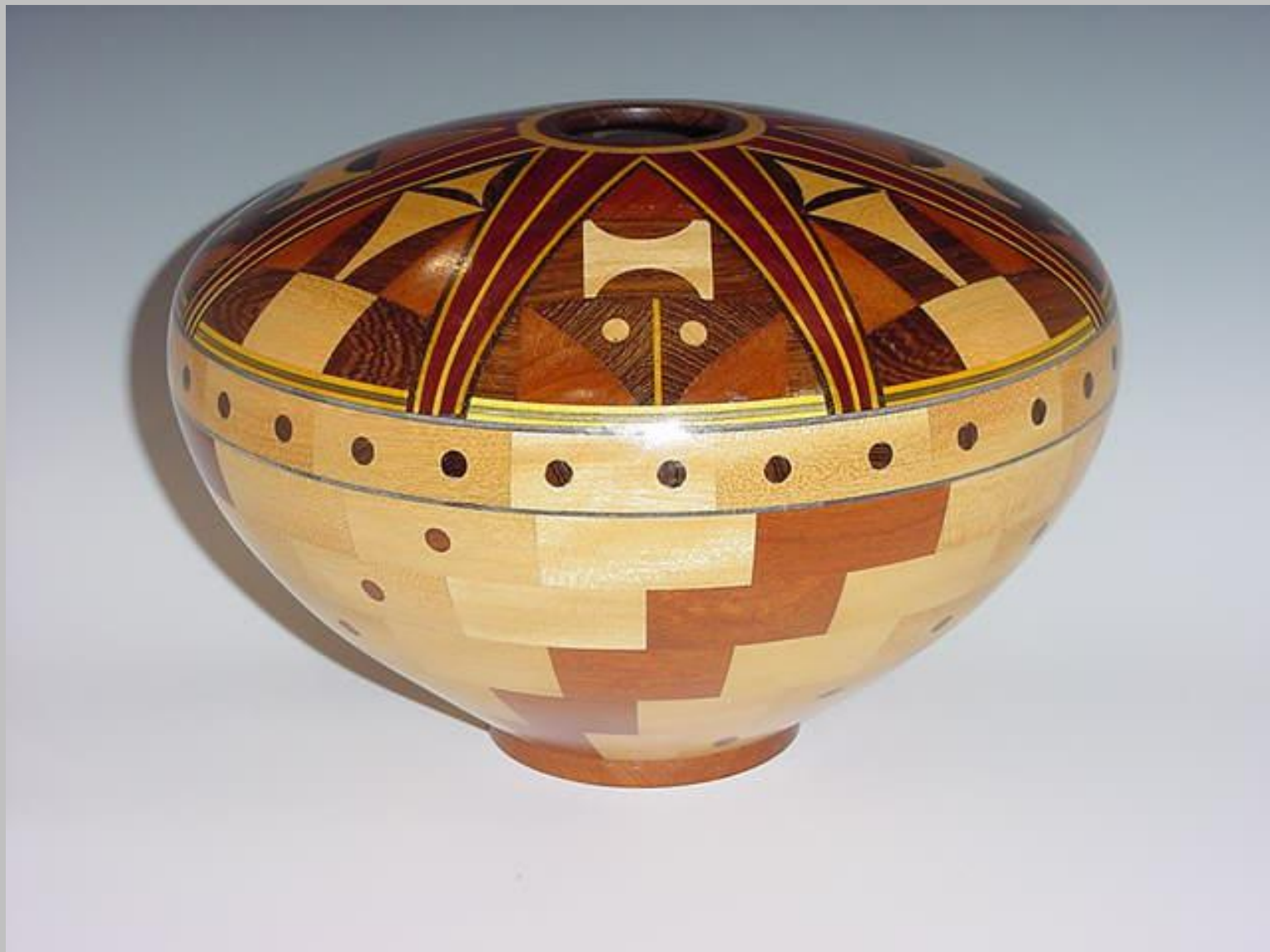
Romeo Corriveau, "Segmented Hollow Vessel"