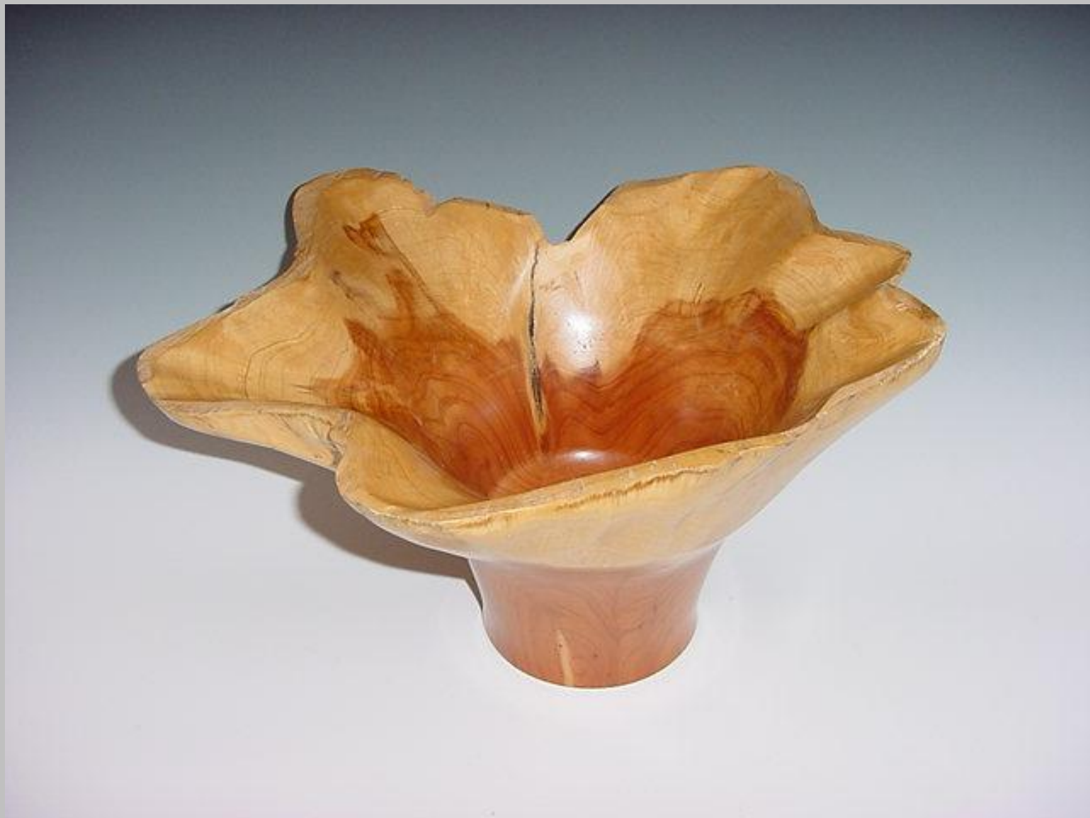
Ken Wood, "Fluted Bowl"