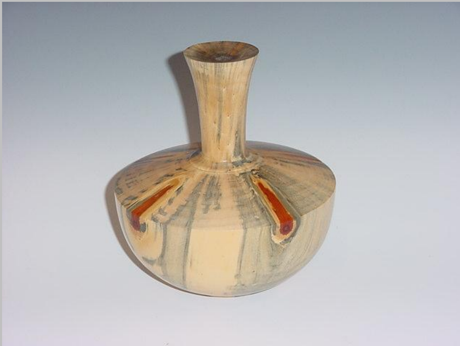
Ron Browning, "Hollow Form", Norfolk Island Pine