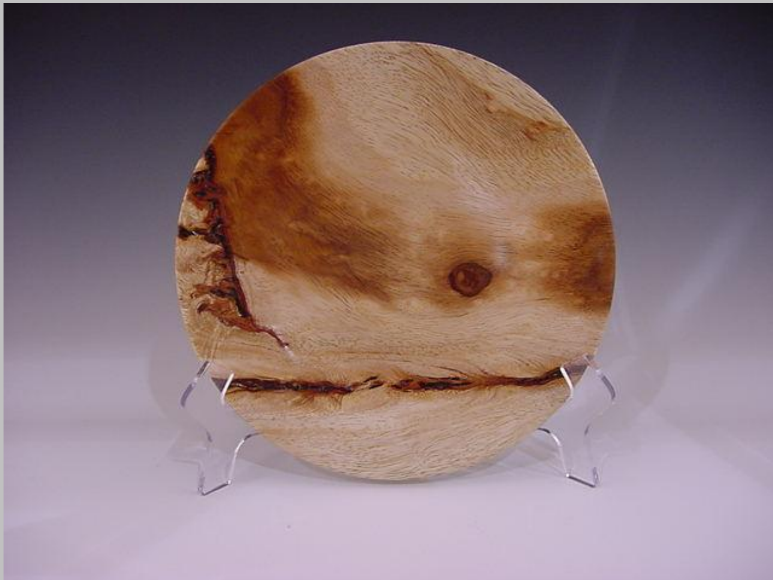
R. B. Middleton, "Moonscape Platter"