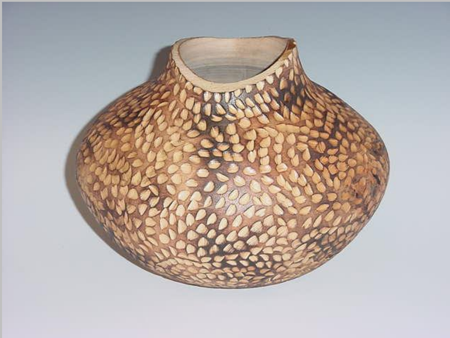
Larry Ramsey, "Textured Hollow Form"