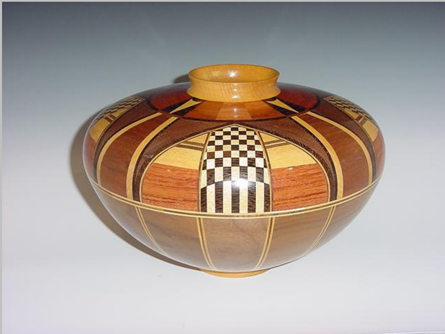
Romeo Corriveau, "Segmented Hollow Vessel"