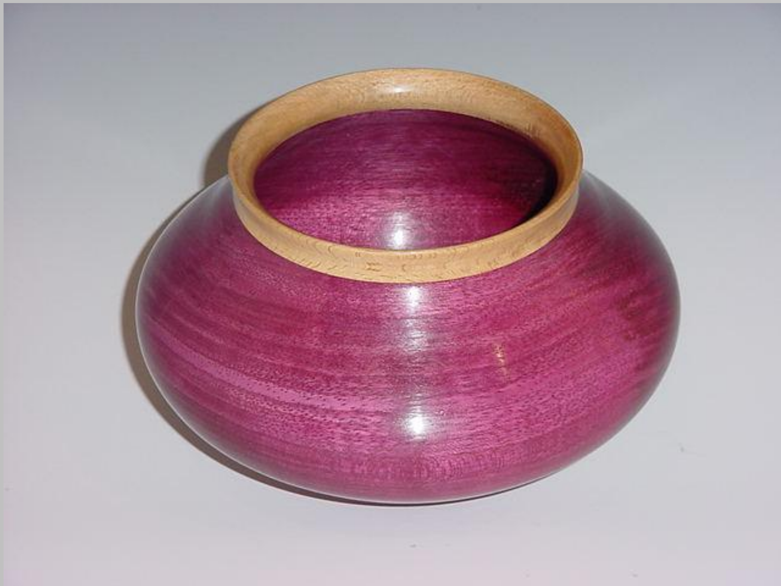
Seymour Plonsky, Purple Heart and Beech, "Vessel"