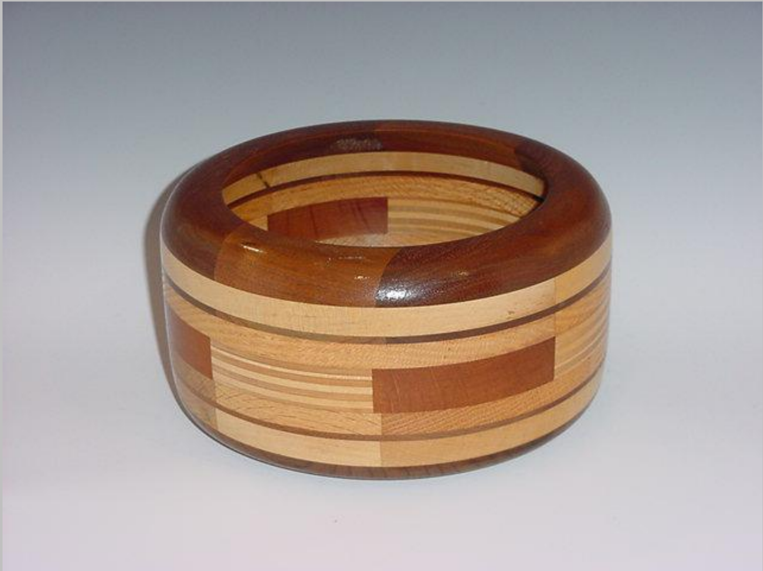
Bob Newell, "segmented Bowl", Walnut, Maple, Oak, Mahogany, Baltic Birch Plywood