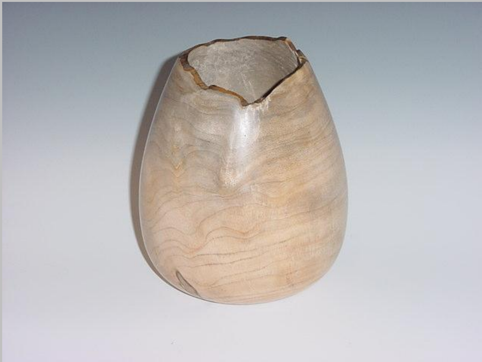
Larry Ramsey, "Vase with Natural Edge"