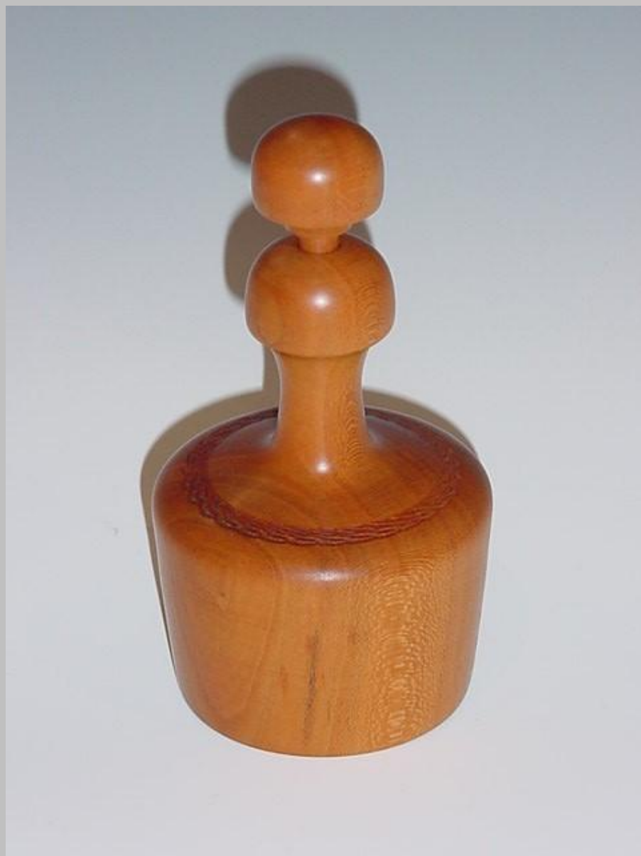
Cliff Sessions, "Biscuit Cutter"