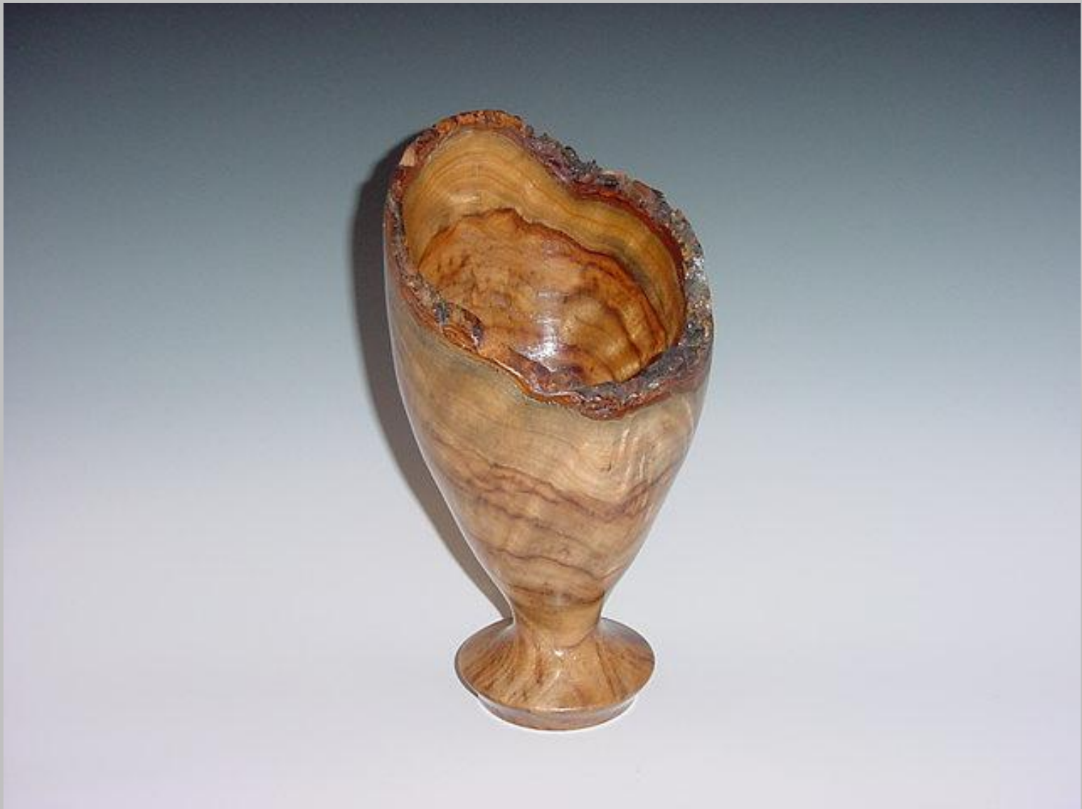
Art Worth, Camphor, "Natural Edge Vase"