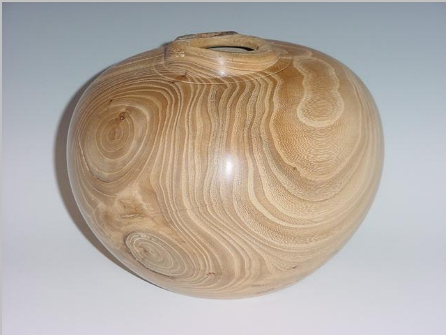
Larry Ramsey, "Natural Edge Hollow Form"