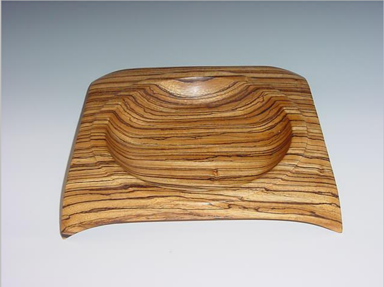
Bill Stebins, "Square Tray", Zebrawood