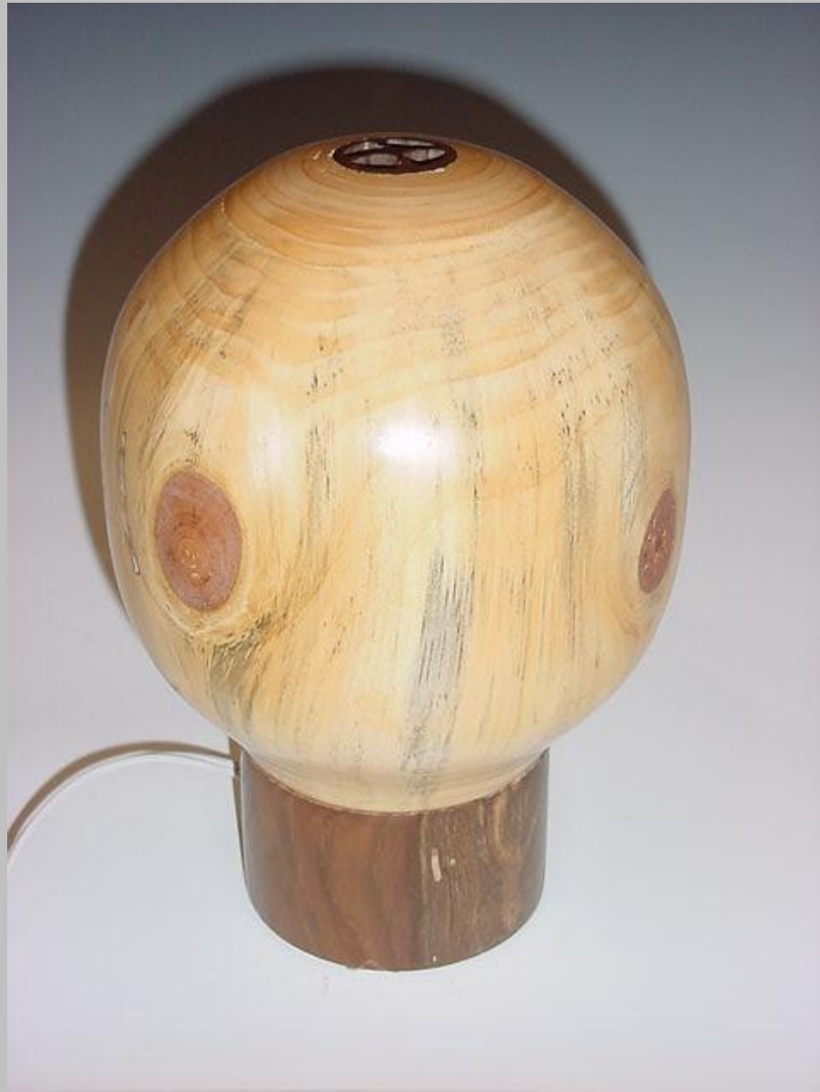
Ken Wood, "Night Light"