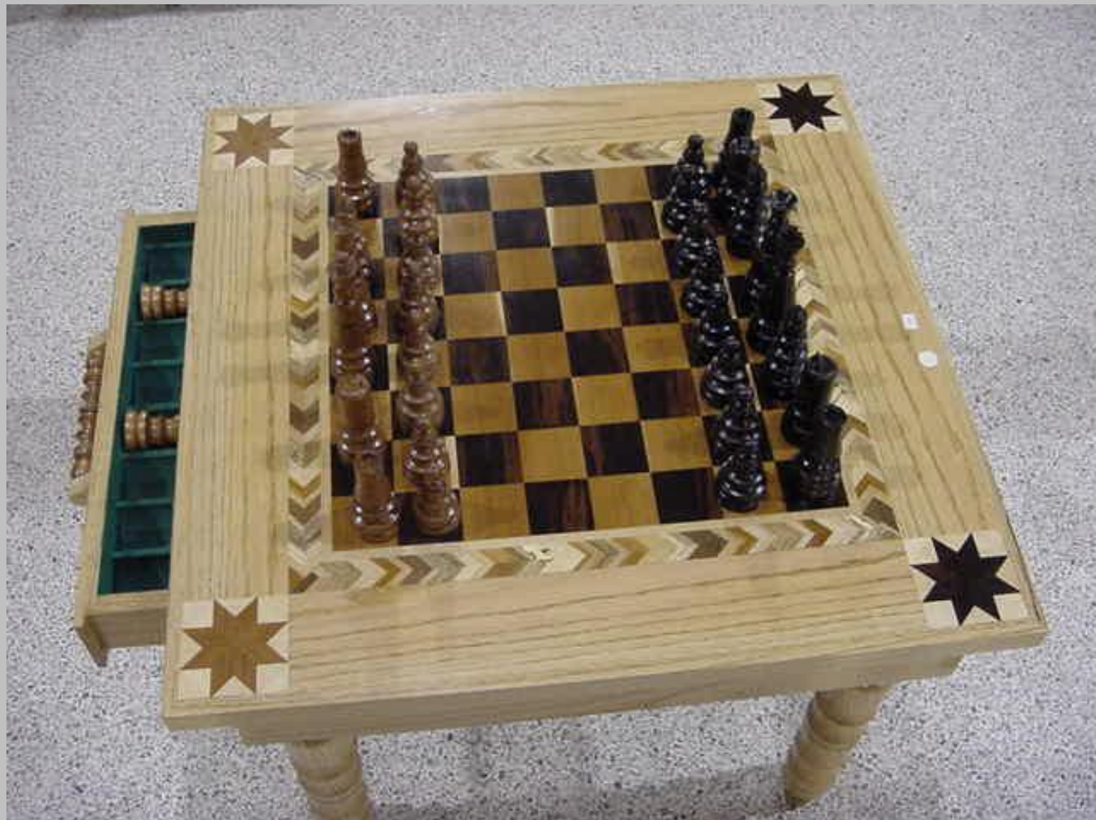
Barrie Harding, "Chess/Coffee Table"