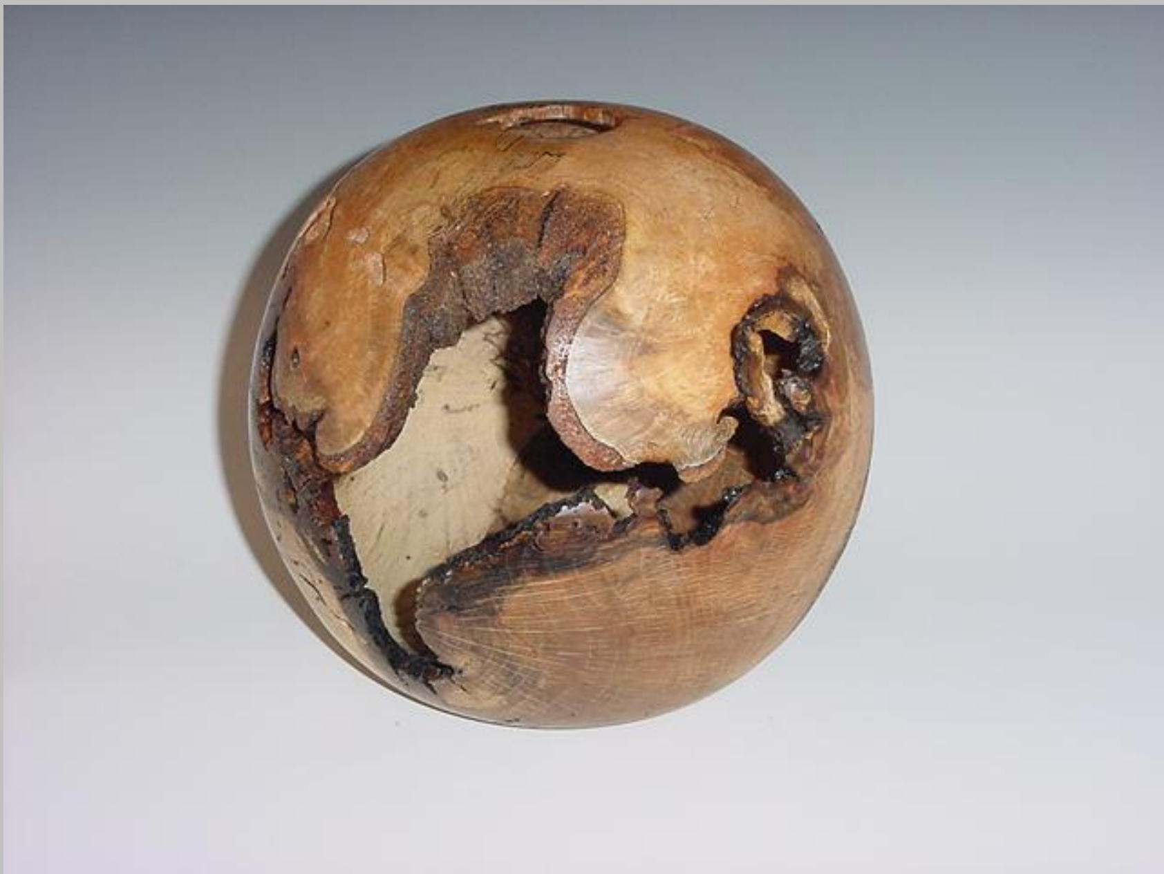
Don Geiger "Planet Water Oak"