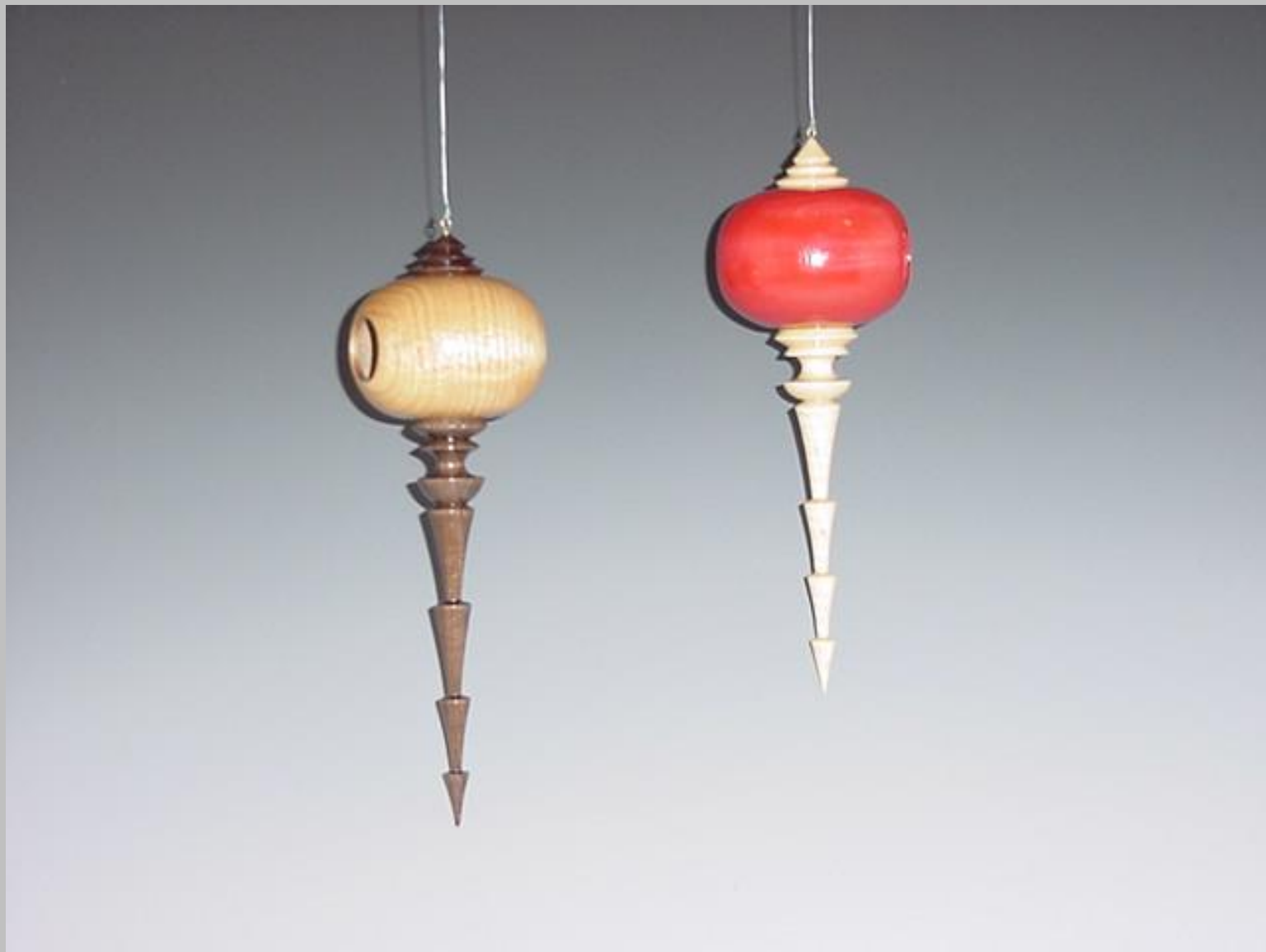
Theo D'Autrechy, "2 Ornaments"