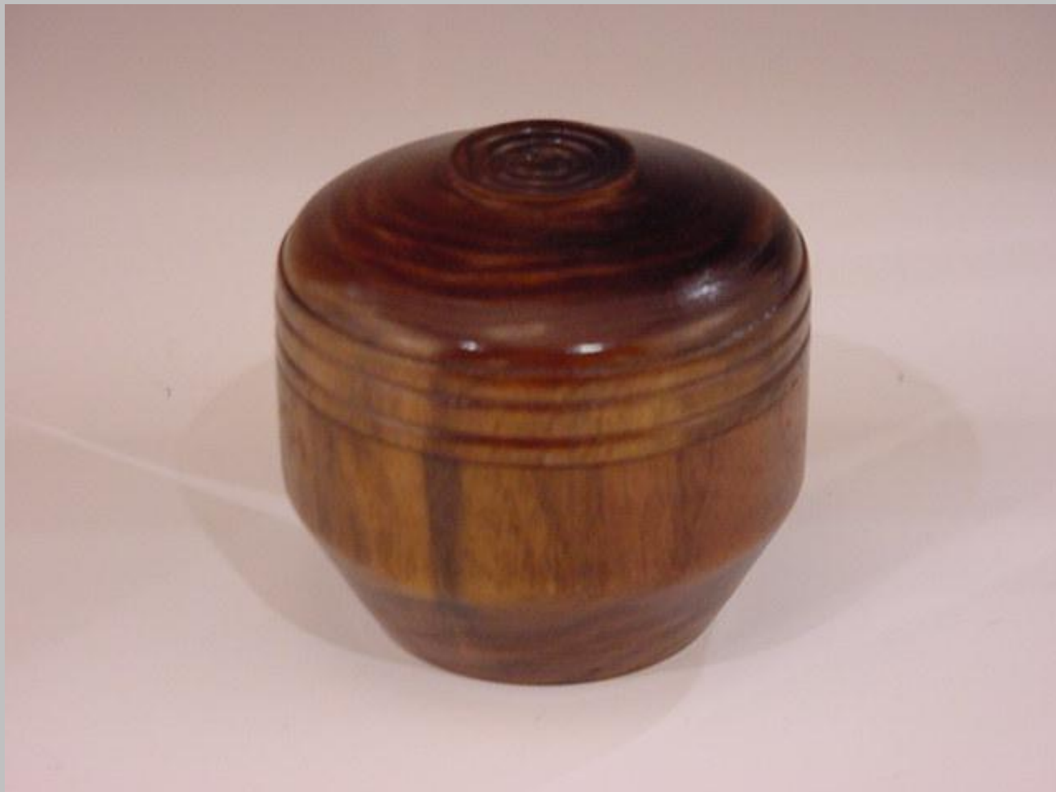
Micheal Adkins, "Small Lidded Box"