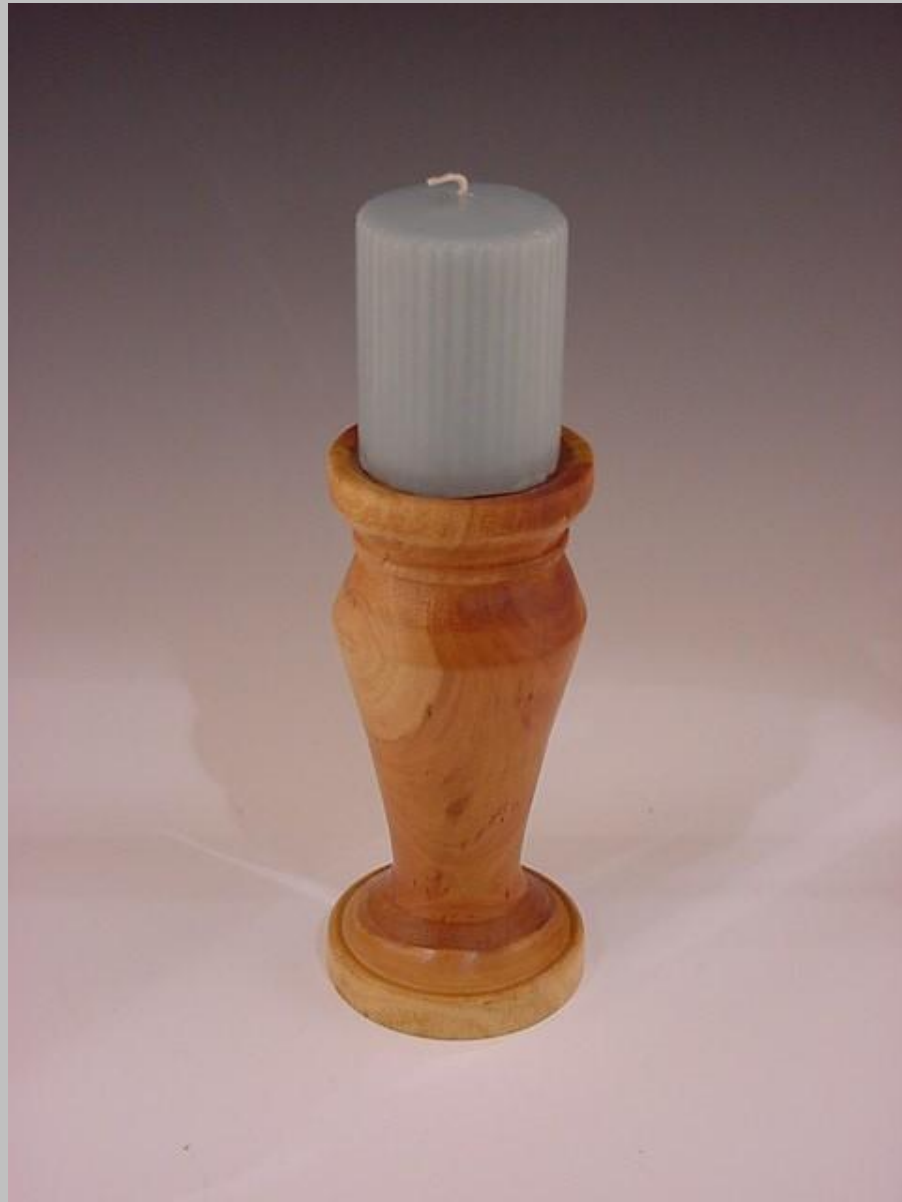
Micheal Adkins, "Candle Stick"