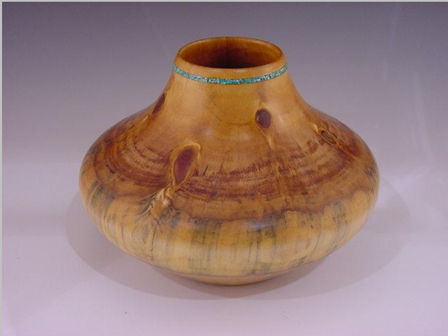
Howard Cutler, "Closed Form", Norfolk Island Pine