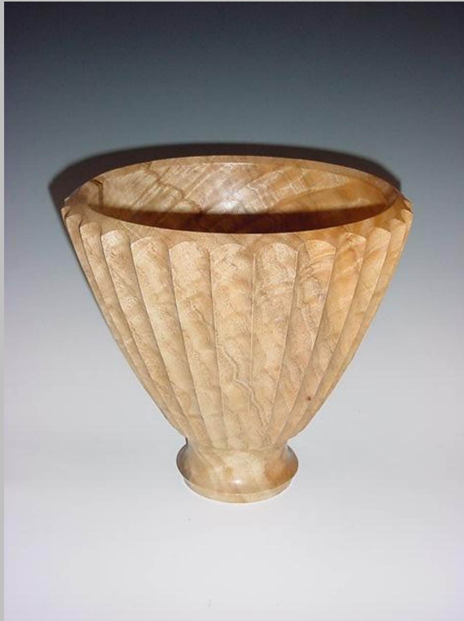
Al Caton, "Vase", Camphor