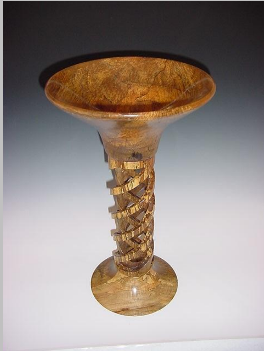
Bob Peshkin, "Double Spiral", Swamp Maple