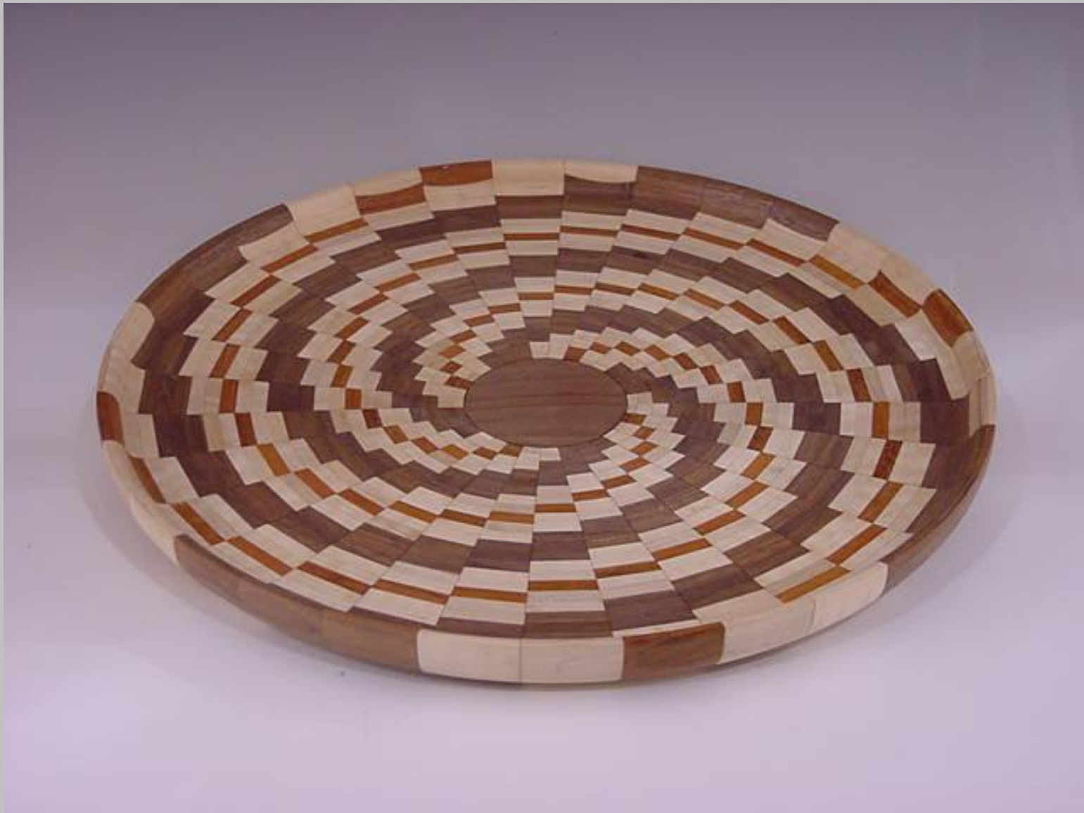
Gene Dampier, "Plate", 768 pieces