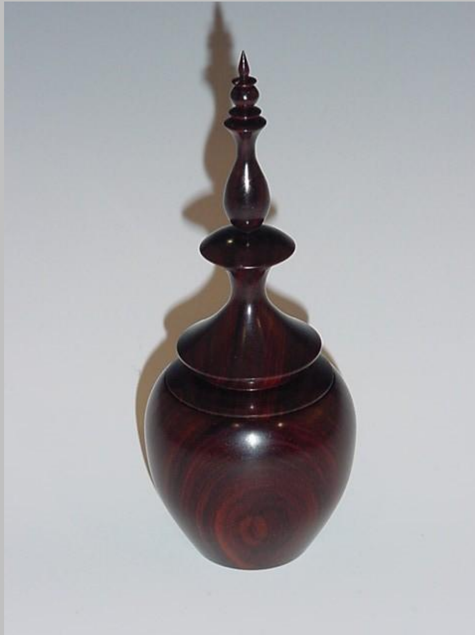
Cliff Sessions, "Lidded Spindle Urn"