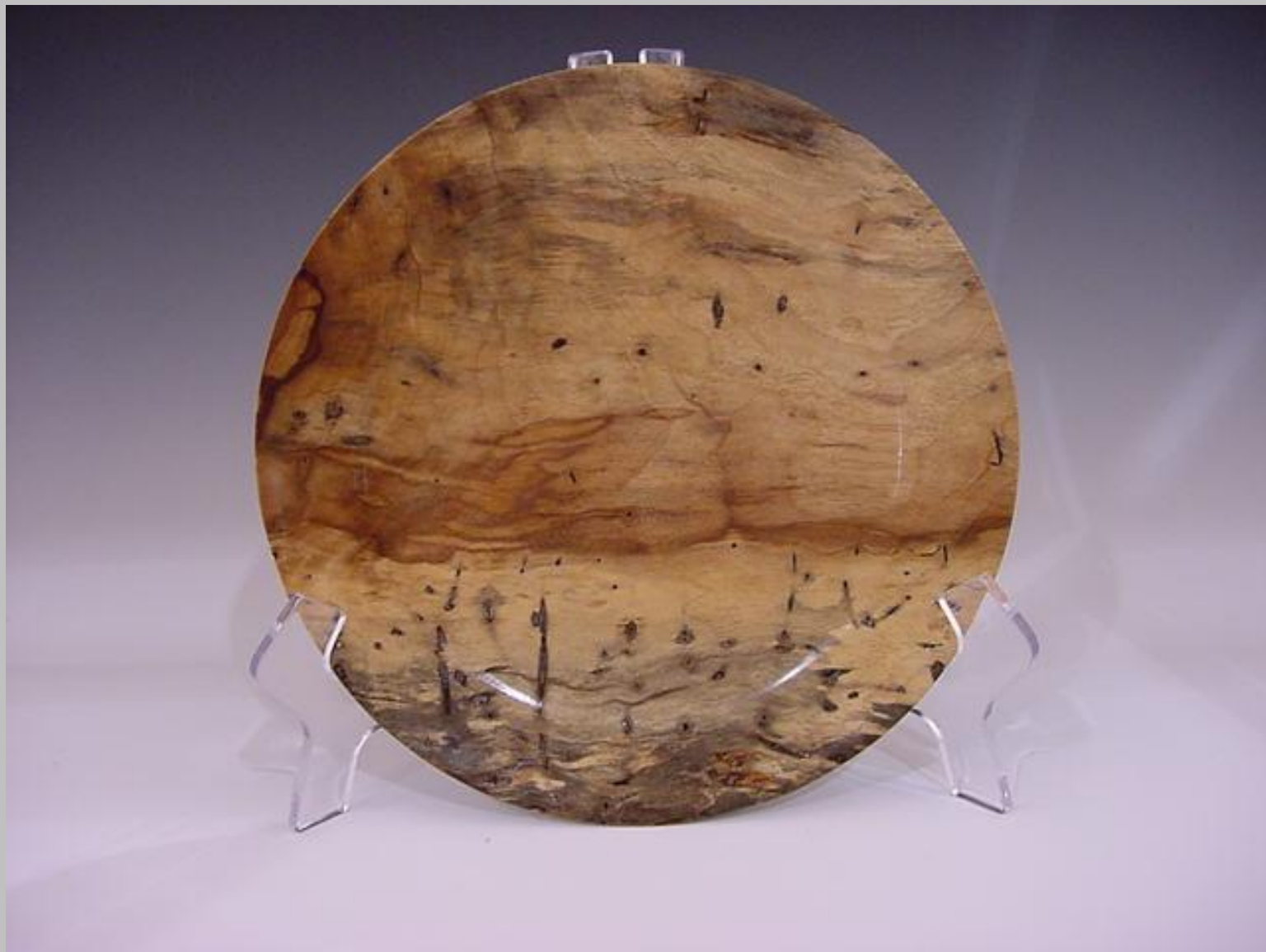
R. B. Middleton, "Desert Scene Platter"