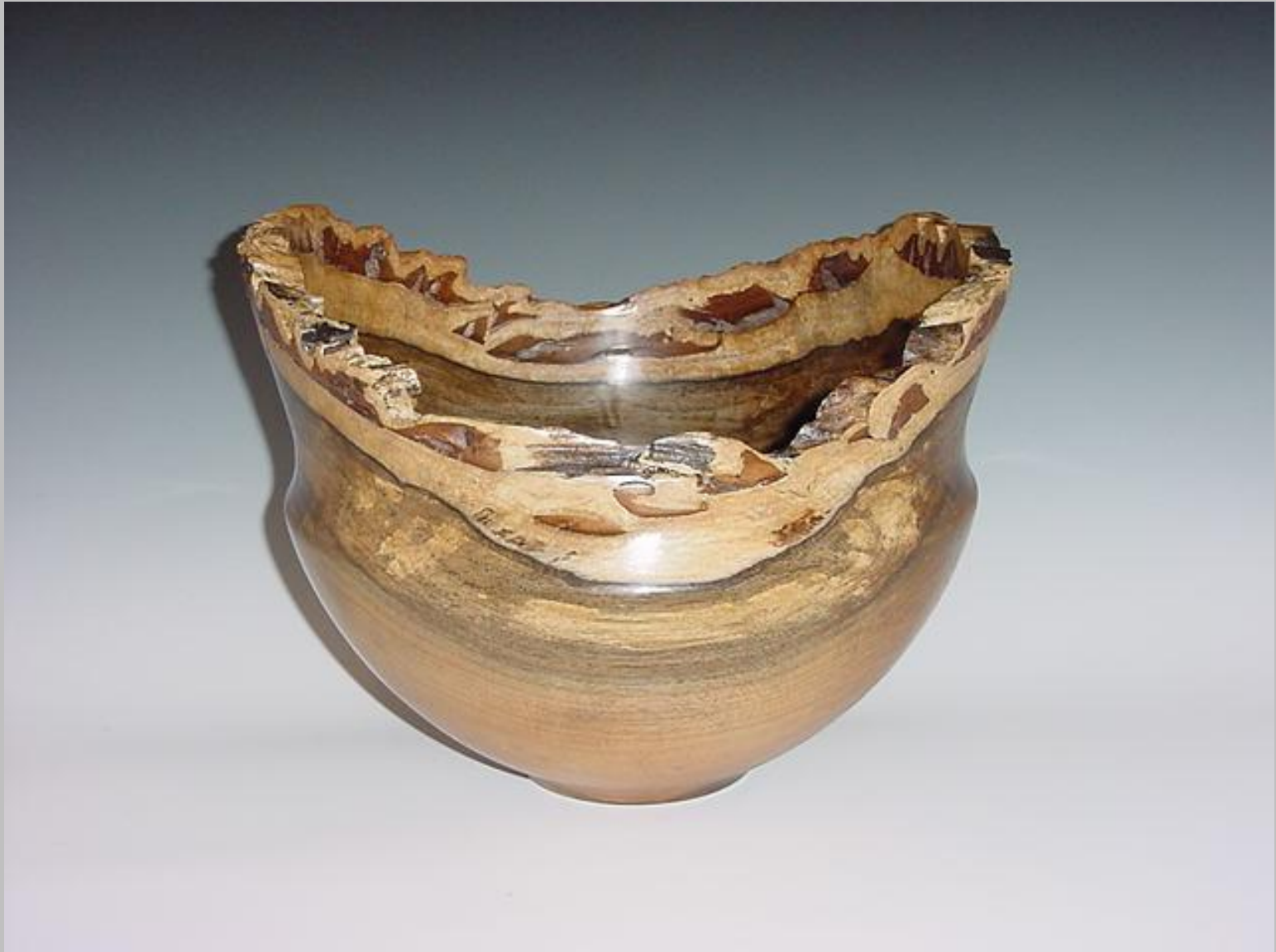
Bill Stebbins, "Natural Edge Bowl"